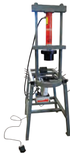
25 Ton Ram