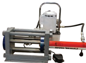
50 Ton Ram