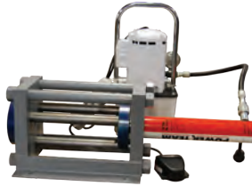
15 Ton Ram

Rams are powerful, finely engineered machines designed specifically to externally swage and internally expand Holedall couplings by hydraulic pressure, securely attaching Holedall couplings to hose. Since each ram generates all the hydraulic pressure required to attach the Holedall coupling, one person can easily operate the equipment.