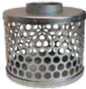
standard strainer round hole type