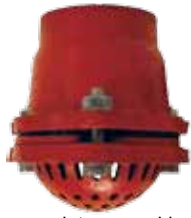
complete assembly threaded