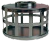
standard strainer square hole type