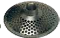
top skimmer round hole type