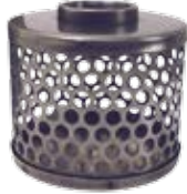
standard strainer round hole type