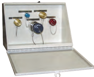
receivers sold separately