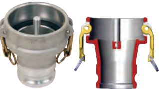
Coupler with Probe x Adapter