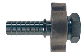
Plated iron / steel