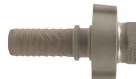
316 stainless steel