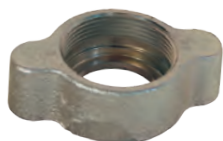
Plated iron / steel