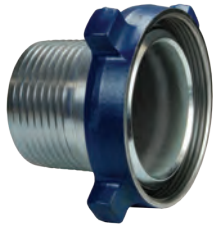
6" and 8"