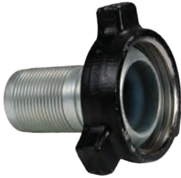
3" and 4"