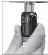
1. vents plug side