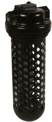
with transparent bowl