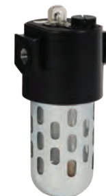
transparent bowl with guard