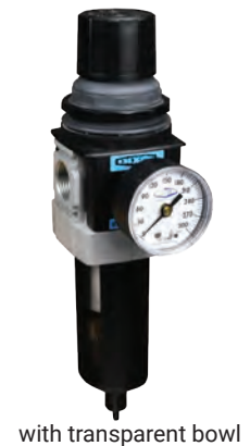
with transparent bowl

NOTE: See pages 312 - 316 for accessories. SCFM ratings at 100 PSIG inlet pressure.