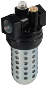
transparent bowl with guard