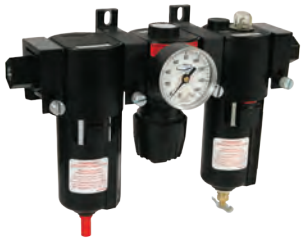
transparent bowl with guard