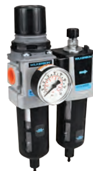
with transparent bowl and guard

NOTE: SCFM ratings at 150 PSIG inlet pressure.