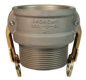
aluminum hard coat