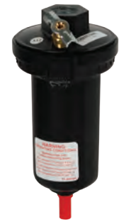
with metal bowl