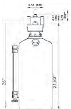
2 and 5 gallon (8 and 20 liter) reservoir ** Optional pyrex sight-feed dome. † Minimum clearance required to remove bowl.