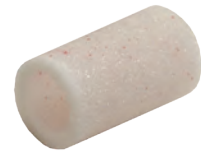
5 micron element 5925-03