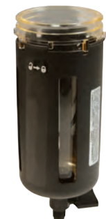
transparent bowl and guard 4325-51R