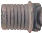
1" - 2-1/2" male