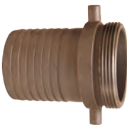
3" - 6" male