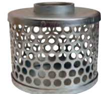
zinc plated steel