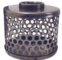
304 stainless steel