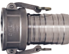
316 stainless steel