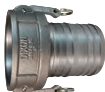
unplated ductile iron