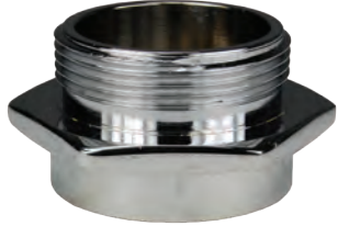
polished chrome plated