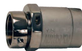
polished chrome plated