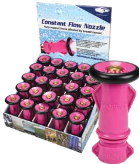
Special Edition Pink Constant Flow Nozzles pg. 11