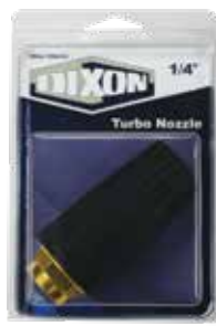
Turbo Nozzles pg. 5