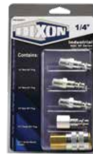
5 Part DF Series Kit pg. 17