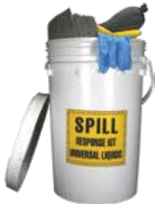
universal spill kit