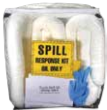
oil spill kit