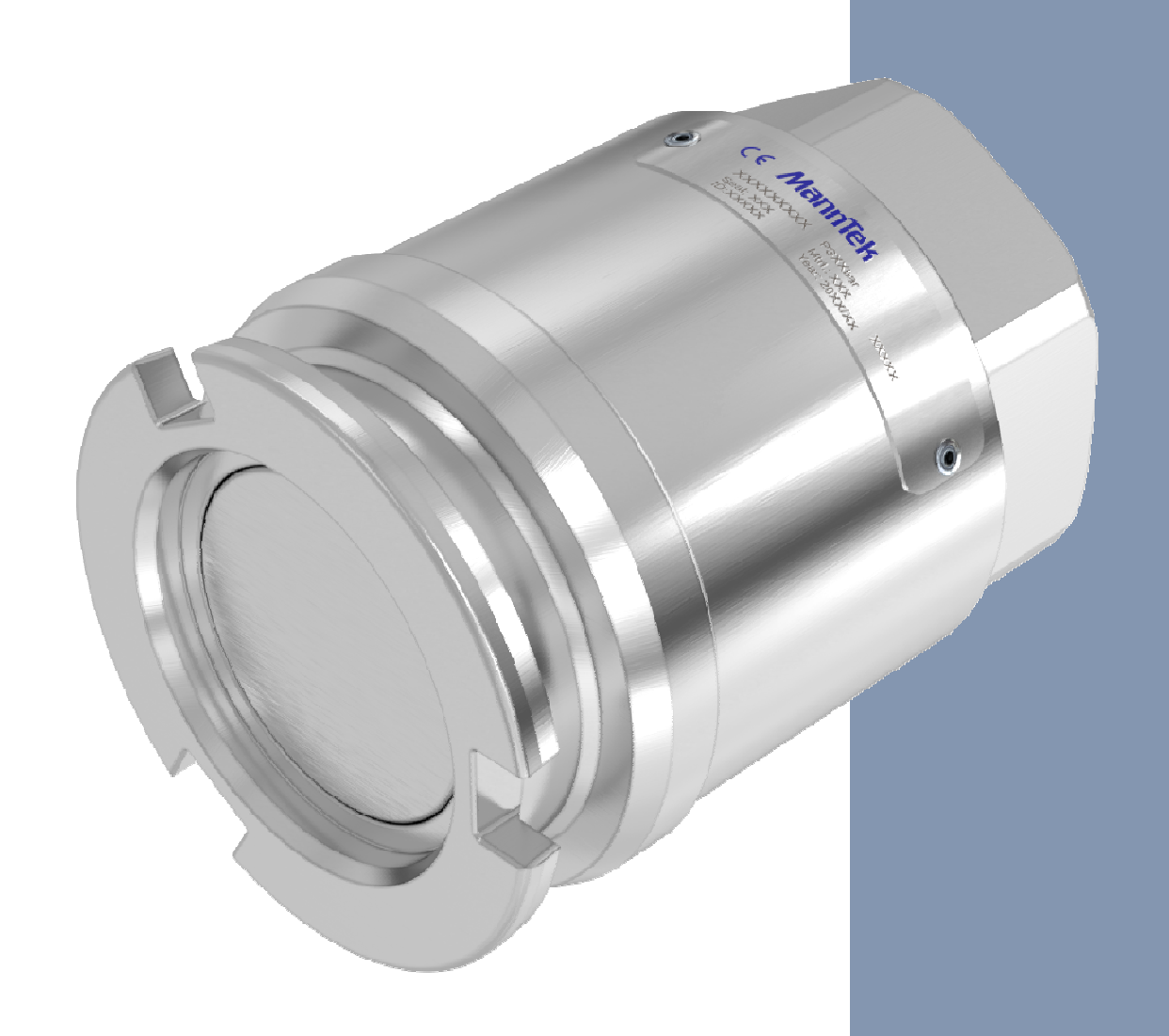
DDC Service instruction 21/2" & 3" tank unit