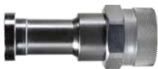
flange head coupler