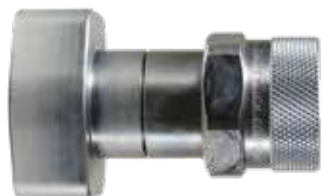
flange pad coupler