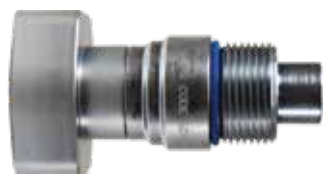
flange pad plug