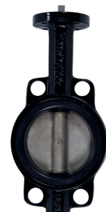
Wafer Butterfly Valve