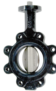
Lug Butterfly Valve