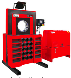
hydraulic crimper CC1000ACT-230/3