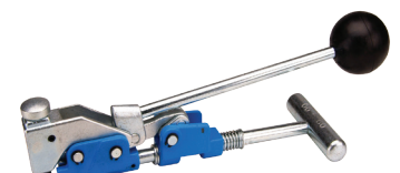
band clamp hand tool F1