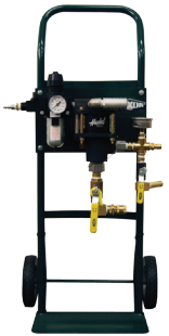
pneumatic hydrostatic test pump PTP