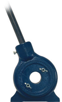
manually operated crimper 5111A