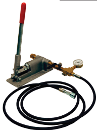
hand hydro test pump HHTP