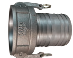
unplated ductile iron