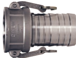
316 stainless steel