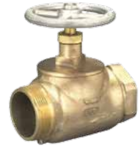
female NPT x male NH